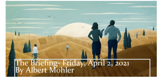
The Briefing- Friday, April 2, 2021 By Albert Mohler